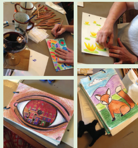
Some of the last summer's retreat projects included lessons on Monet, Magritte, and several How to Draw tutorials.

A buffet breakfast will be offered before guests leave for home, with retreat notebook filled with all the lessons plans that the weekend covered.