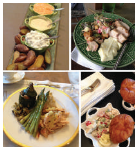
Just a few of the delicious meals and appetizers served at the 2014 retreat.

Mail to RQS Productions, Inc., 12840 Moorpark St. #307, Studio City, CA 91604