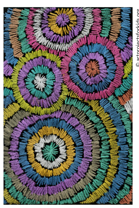
6. To finish, add one last big burst in the back that fills up the entire page. It will help the front fireworks stand out more.