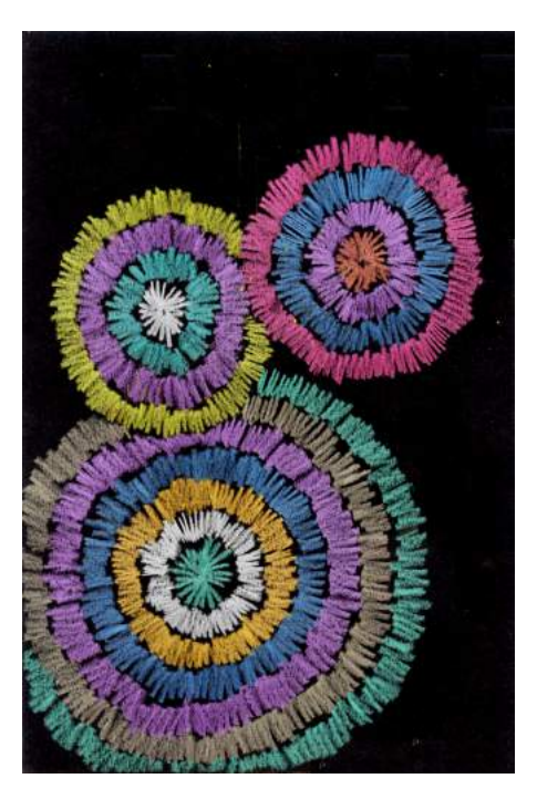
5. Add rings to the firework in the back. Continue, making sure the rings are consistent. It works best when rings look like they are all in one group.