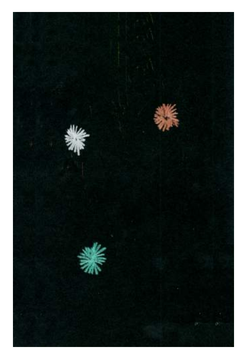
1. Start with about three small flower shapes, leaving lots of room between each one.