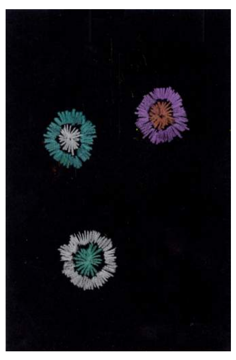
2. Add a ring around each. Try to be consistent, making each ring either a loose or a tight zig zag.