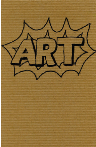
8. Use the marker to draw a shadow on the bottom and right sides of each letter.