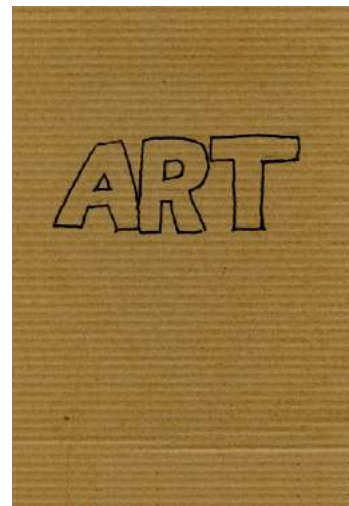
3. Trace the block letters with a black marker. Erase all pencil lines.