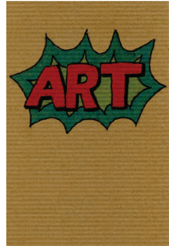
9. Color all with contrasting letters. Add your name below.