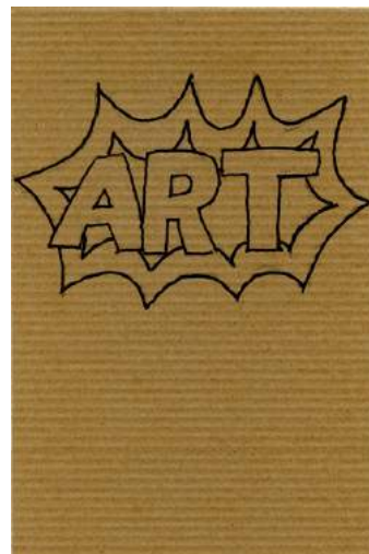
7. Trace the larger burst with the marker.