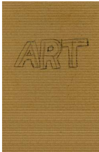
2. Lightly trace around the stick letters to turn them into block letters.