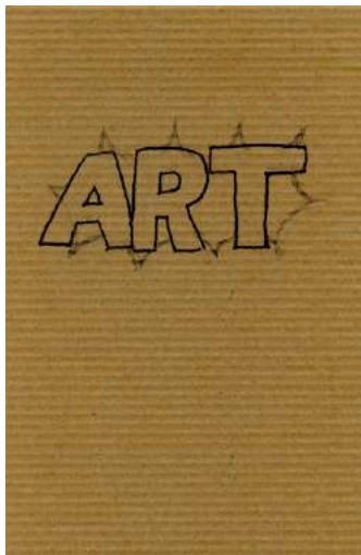
5. Erase all the burst lines inside the block letters.