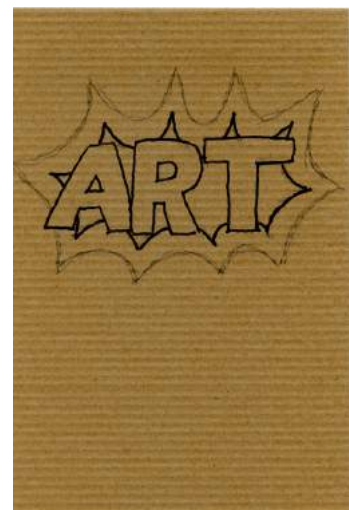
6. Trace the small burst lines that are left with a black marker. Draw a larger burst around the outside.