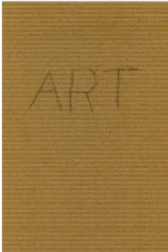
1. Lightly draw large capital ART stick letters.