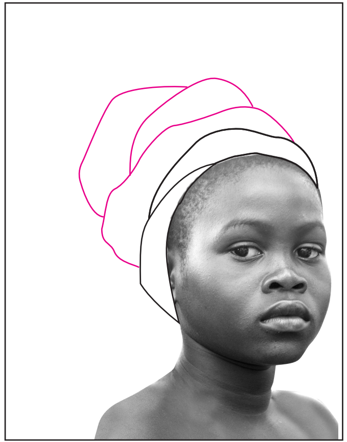
2. Add about 3 more, which balance each other out.