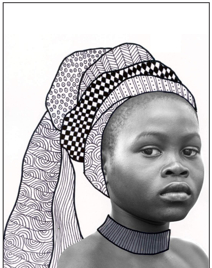
4. Trace with thick marker, add patterns with thin one.