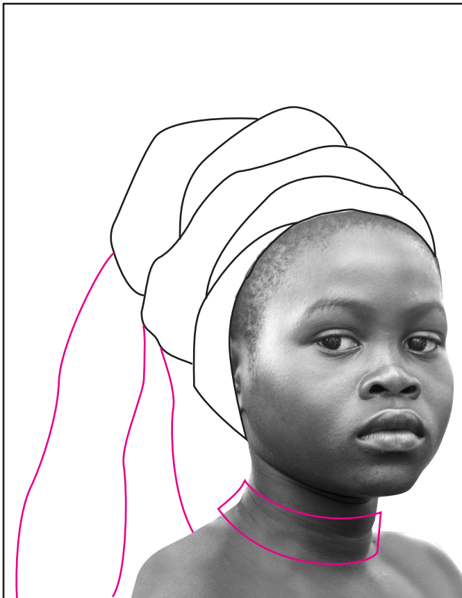
4. Draw extra material hanging down, and neck band.