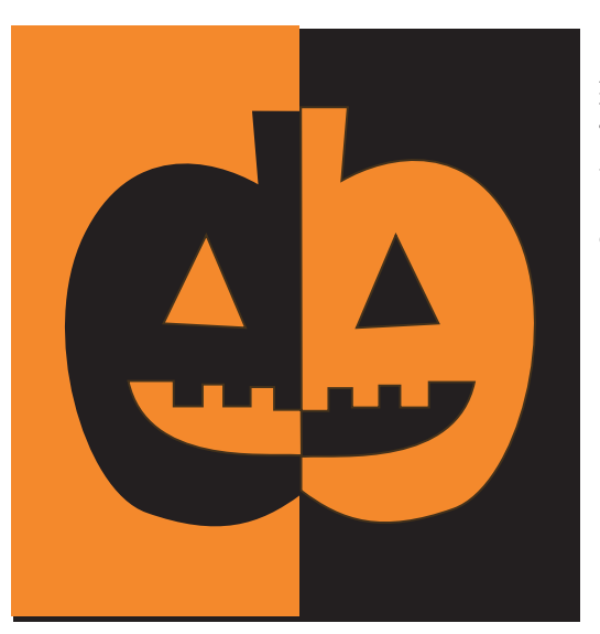
6. Match the orange mouth to the black and glue. Place the orange eye and glue.