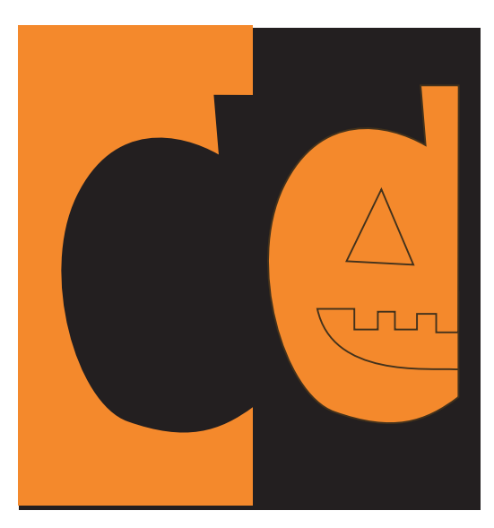
3. Cut out the half pumpkin.