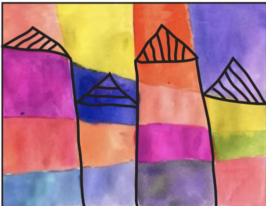
7. Add lines to the roof.