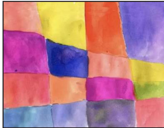
2. Paint the inside of each block with watercolor.