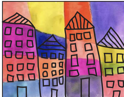
8. Draw windows and doors.