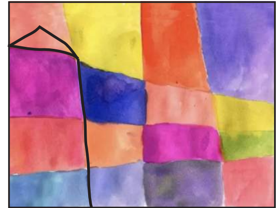
3. Draw a left building, following the paint lines.