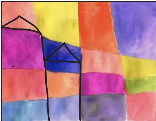
4. Draw another, the roof may be inside a block.