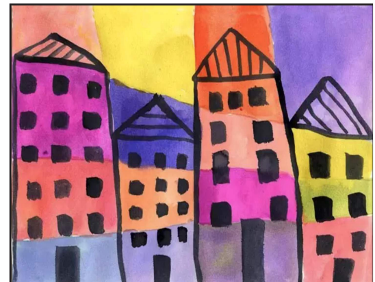
9. Fill in the windows and doors with black.