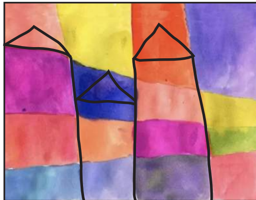
5. Draw another simple building, roof included.