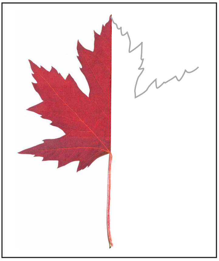
1. Start to draw the missing outline of the leaf with a pencil.