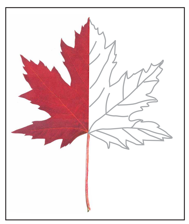
3. Add the vein lines, still drawing with a pencil.