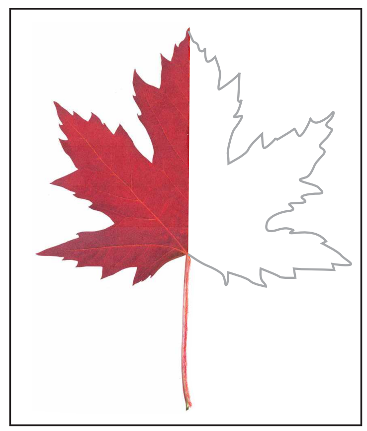
2. Finish the outline. Try to make it as symmetrical as you can.