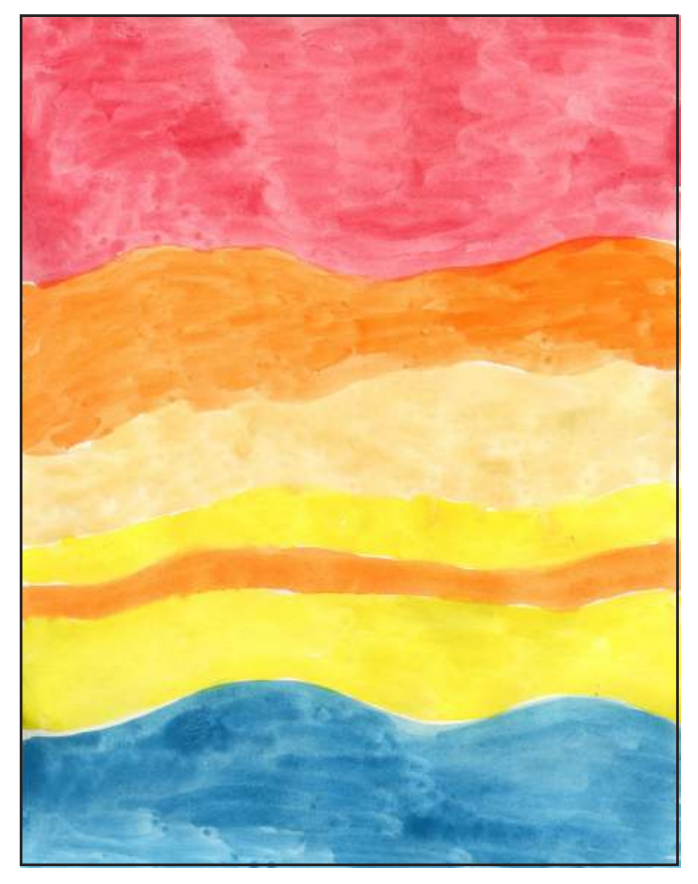
1. Paint waves of color on mixed media paper. This example was made with tempera cake paints.