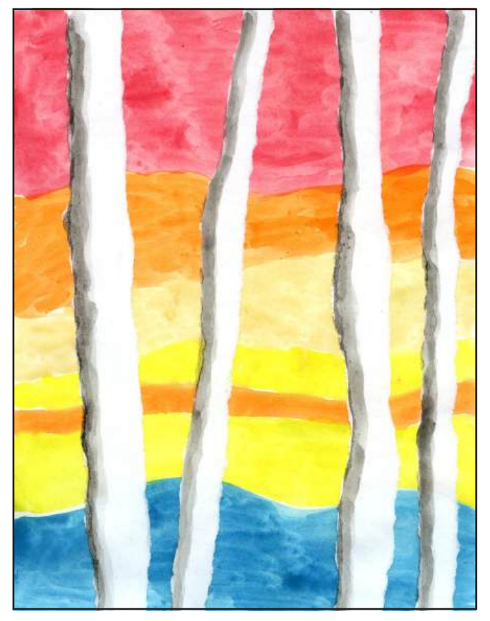
3. Mix gray by making a very watery black. Brush on one side of the trees to make a shadow.