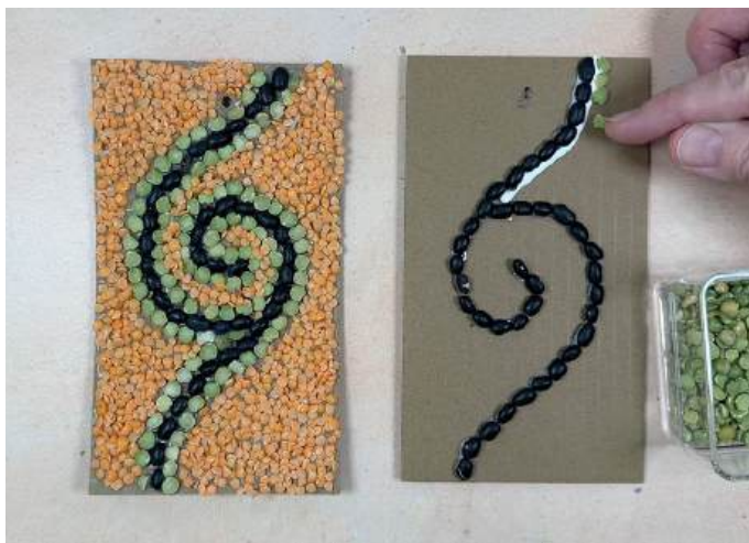
3. Add a line of glue to the side. Slide split green peas in place. Work in sections, and continue until the outline is done.