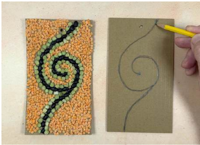
1. Draw a swirl with a pencil on corrugated cardboard.