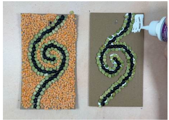
4. Working in sections, cover the background with glue.