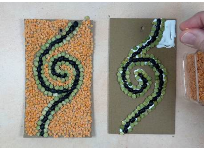
5. Sprinkle carefully with red lentils.