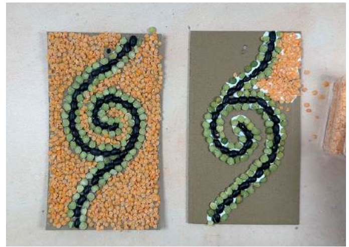
6. Tap down to secure, repeat until the background is complete.