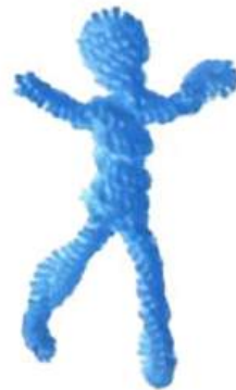
5. Continue to wrap the torso until the length is all used up.