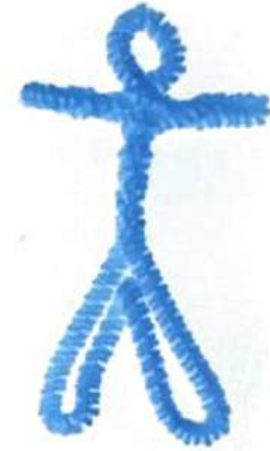
3. Twist 3 or four times to make the torso. Use the remaining length to form two legs.