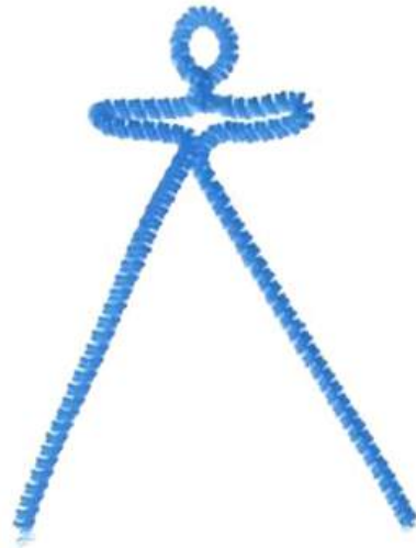
2. Form two symmetrical folded arms that are the same length.