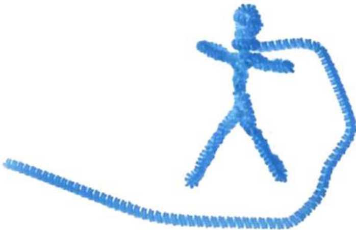
4. Twist the legs so they look like one thick pipe cleaner. Take the second pipe cleaner and start to wrap the head.